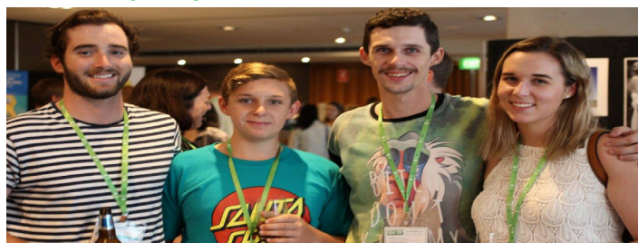
2015 Youth Cancer Summit attendees