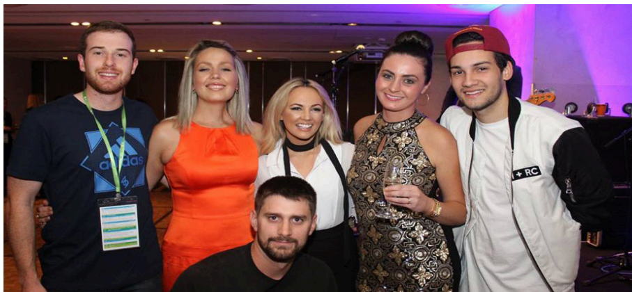
Samantha Jade (middle) with some Youth Summit attendees

Song Division kicked off the Summit Party for young people and finished with a surprise performance from 2012 X Factor winner, Samantha Jade. Simultaneously CanTeen hosted a dinner in Darling Harbour for the parents of cancer patients/survivors.