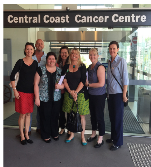
YCS staff visited the Central Coast Cancer Centre

Finally, we hope you all enjoyed the Summit and Congress and all of us would like to wish you a joyful Christmas and a wonderful 2016!