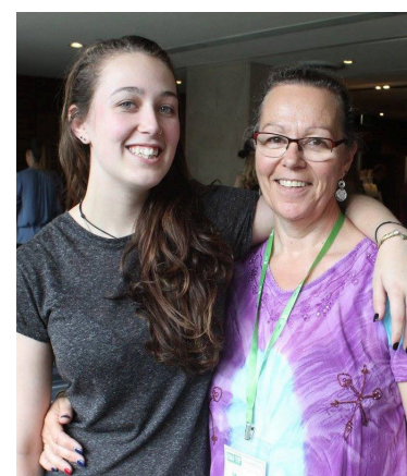
Youth Summit attendees enjoyed two days of activities and presentations